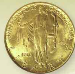
1926 Sesquicentennial Independence $2.50 Quarter Eagle Commemorative