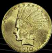
Augustus Saint-Gaudens Designed $10 Indian Head Eagle