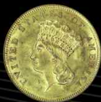
Popular Low Mintage Series $3 Indian Princess