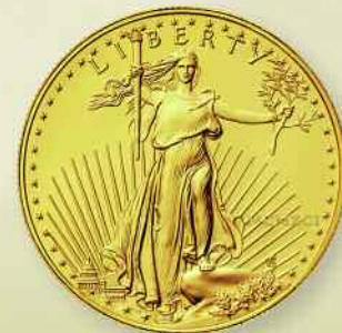
1991 $25 Gold American Eagle