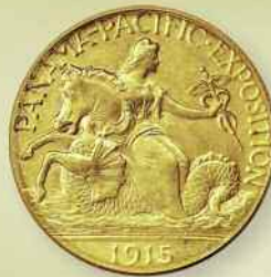
1915-S Panama Pacific Exposition $2.50 Quarter Eagle Commemorative

In 2005, for the first time in our history, we expanded our top coin recommendations to include two rare and unique gold commemoratives: the 1915-S Panama-Pacific Exposition Quarter Eagle and the 1926 Sesquicentennial Independence Quarter Eagle. While they commemorate distinctly different events in U.S. history, they are the only two gold commemorative Quarter Eagles in U.S. history. By overall mintage and surviving population, these are two of the rarest coins we have ever recommended. As such, they are also considered “stopper” coins to acquiring the complete set of commemorative gold coins. For more information on acquiring these coins to add to your personal collection, contact your Account Representative today.