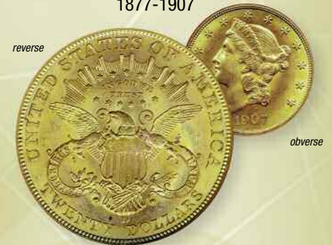
Type III Double Eagles changed reverse dollar denomination from "TWENTY D" to "TWENTY DOLLARS"