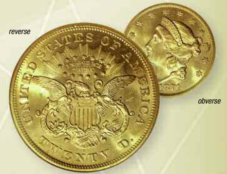
Type II Liberty Double Eagle the first to bear "In God We Trust" motto.