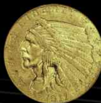
Popular Rare Incuse Design $2.50 Indian Head Quarter Eagle and $5 Indian Head Half Eagle